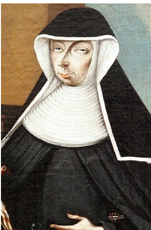
St Maria Crescentia Hoss 1682-1744

Born as Anna Hoss, into a poor family, she aspired to religious life. The monastery of third order Franciscans accepted her when asked by someone who had done a favour for the community. Anna was accepted without a dowry but was resented and treated badly