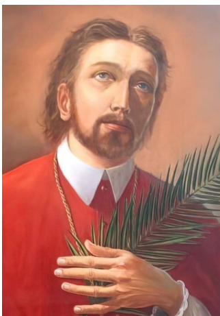
St Marko Krizin 1588-1619

St Marko was originally from Croatia, but went to study first in Austria and then in Rome. He was ordained a priest for the Diocese of Zagreb. He became the Rector of the seminary there after ordination, and a Cathedral Canon. In 1619, Marko was sent to Hungary, at the