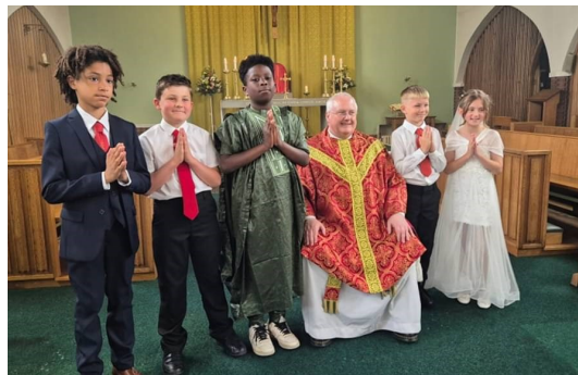
Children from St Joseph's Academy received First Holy Communion at St Joseph's Church on 30th June