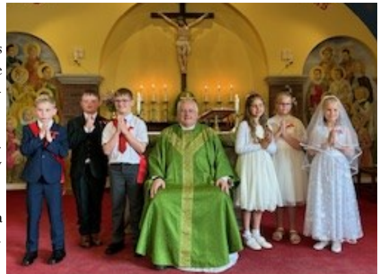
Children from Our Lady of Grace Academy received First Holy Communion at English Martyrs' Church on 23rd June