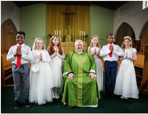
Children from St John's Academy received First Holy Communion at St Joseph's Church on 9th June

During the month of June, children from our Parish received First Holy Communion at three Sunday Masses. Here are their reflections on their First Communion.